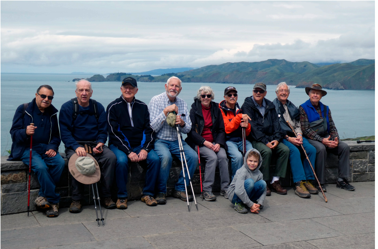
Presidio Walk March 2019