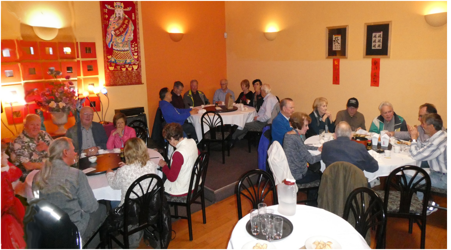
Chinese New year Feb 2019