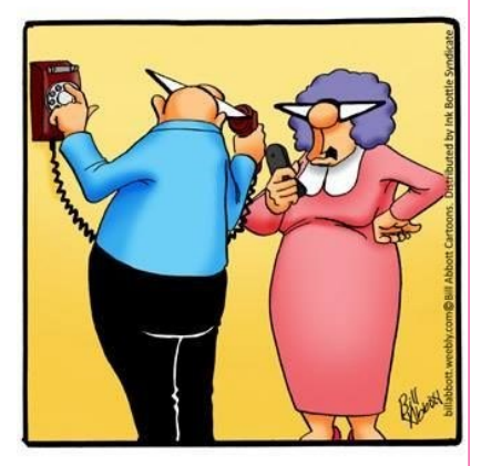
"Nothing yet. Try sending me another text."