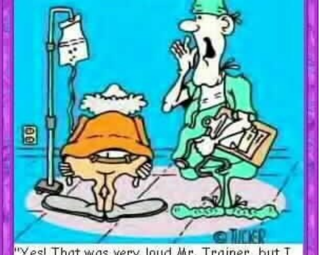
"Yesl That was very loud Mr. Trainer, but I said I wanted to hear your HEART!"