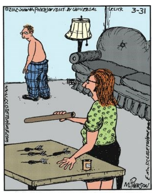
"I TOLD you, I saved a ton by getting your meds from an online pharmacy in the Amazon. Now turn around."