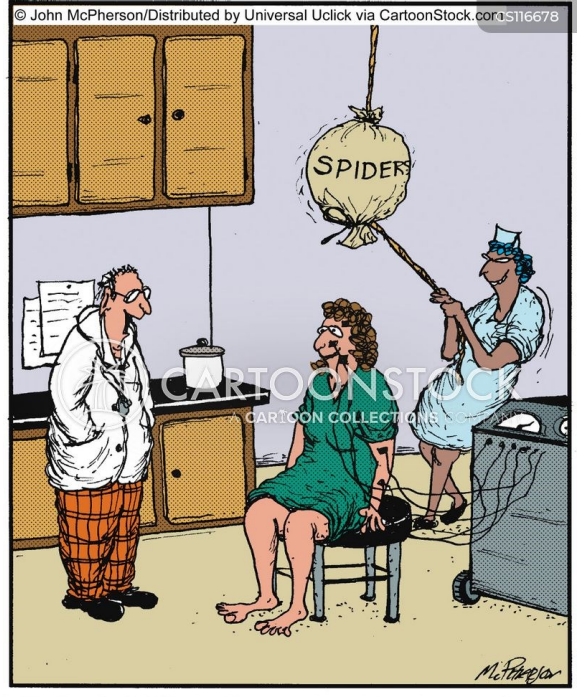
"That's right! No huffing and puffing for 30 minutes on a treadmill. We've developed a new stress test that is faster and more accurate."