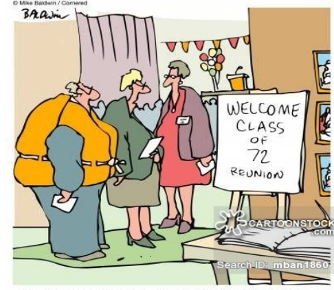
"He's wearing a life jacket just in case this brings back a flood of memories."