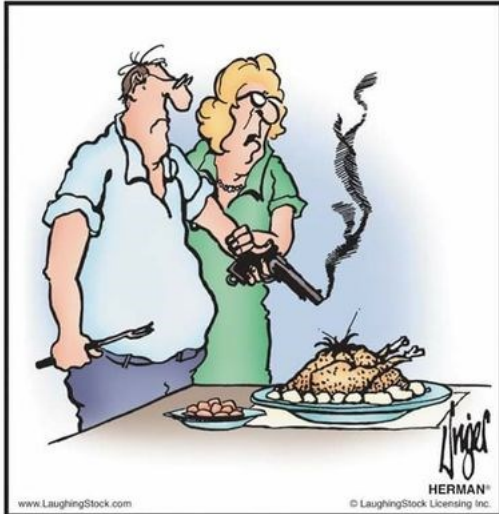
"It wasn't THAT under-cooked."