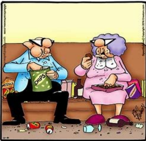
"Hurry! Our New Year's resolutions start in ten minutes."