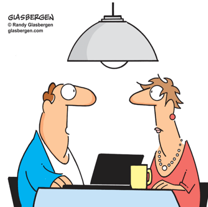
"When you review your retirement fund then wet your pants and cry — that's liquidity."