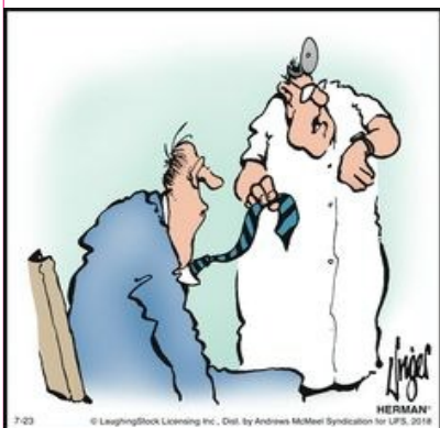
"Your pulse is very, very weak!"