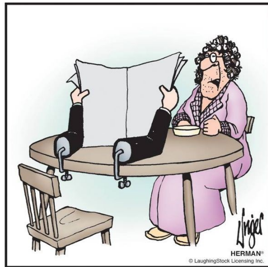
"I sometimes wonder if you hear one word I say!"