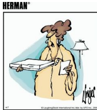
"I don't want to worry you, but the guy who delivered the pizza was your financial planner."