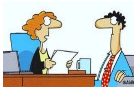
"Your résumé is bloated with half-truths, false praise, exaggeration and unsubstantiated accomplishments. I'd like to hire you to write our Annual Report."