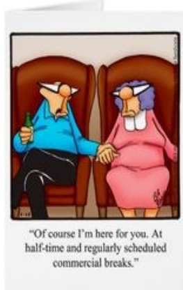
"Of course I'm here for you. At half-time and regularly scheduled commercial breaks."