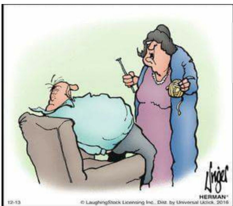
"Oh, good! Is that my other knitting needle?" Found it! 😊