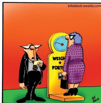
"It says, '...can't breathe... get off!'"