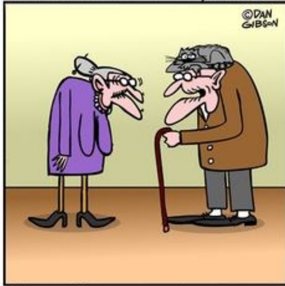
I'll return him as soon as I get my toupee back from the dry cleaner.