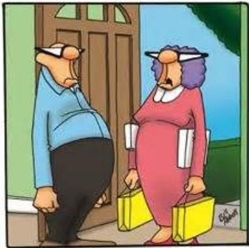
"I left your credit card outside. It's still smoking."