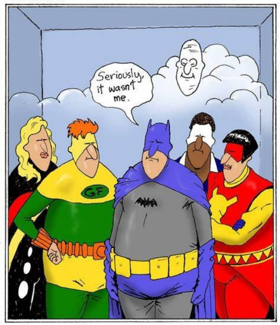
Sometimes, Metamorpho amused himself by making hydrogen sulphide in elevators.