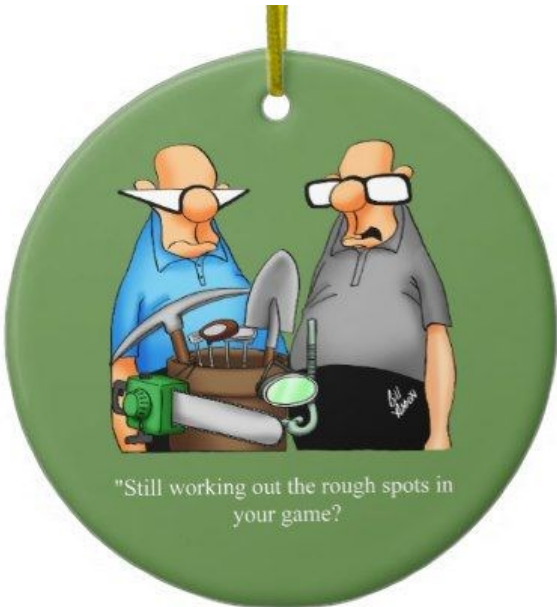
“Still working out the rough spots in your game?”

BIZARROCOMICS.COM Facebook.com/BizarroComics Dist. by King Features