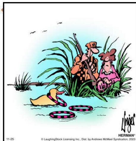
“If you’re bored, go home.”