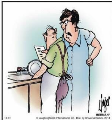
“Memorize this, it’s your New Year’s resolutions.”