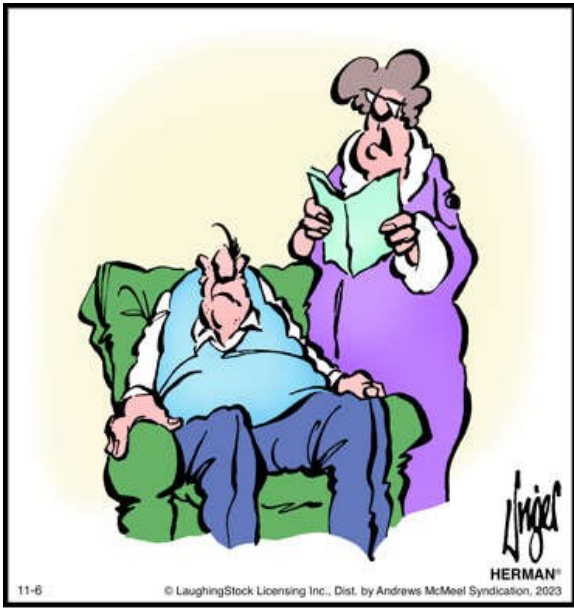
“There’s nothing on TV. D’you want to have an argument?”