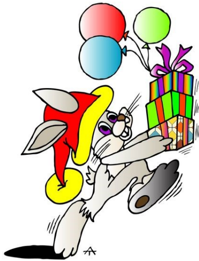
HAPPY NEW YEAR!