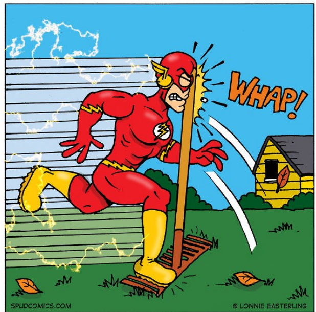
THE FLASH'S DEADLIEST FOE, THE RAKE, ATTACKS!