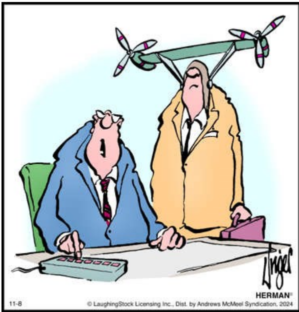
"If anyone needs me, Joyce, I'll be up on the roof for about 20 minutes."