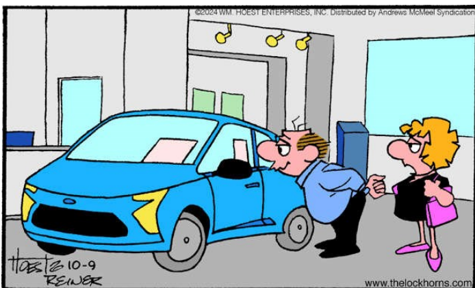
"BUY AN ELECTRIC CAR? YOU CAN'T EVEN REMEMBER TO CHARGE YOUR PHONE."